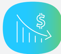
Minimize net fraud losses