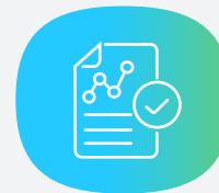
Maintain accurate, audit-ready reporting