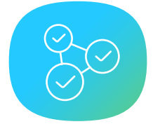
Linked identifiers (emails, phone numbers, devices)

This enriched context accelerates the identification of first-party fraud and repeat offenders, reducing investigation time from hours to minutes and enabling faster and more accurate decisions on claim validity. Once confirmed, cases seamlessly transition into reimbursement and recovery workflows, ensuring compliance with regulatory timelines and minimizing financial losses.