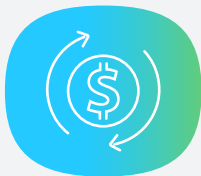
Maximize recovery rates

This dual-leg view enables institutions to: