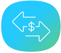
Sender and receiver profiles

Embedded entity insights and network visualizations provide investigators with immediate visibility into sender and receiver details, including: